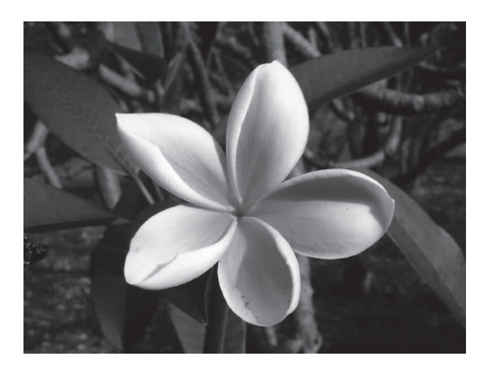
Figure 2. Plumeria [Frangipani] flowers

Clearly, a four-armed or four-'petalled' shape was a pleasing one for many craftsmen and craftswomen in Oceania, whether it was comprised of a set of pointed ovals or circles, four inverted isoceles triangles, four thin triangles arranged diagonally (i.e. in an x-shape) or as a thin-armed vertical cross (+).8 The origin of the motif is ancient in Pacific terms – it was one of the many designs incised or stamped on ceramic ware made by the Lapita travellers.