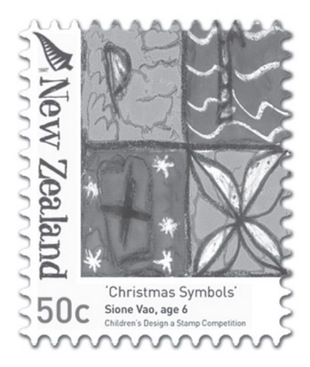
Figure 4. New Zealand Post Ltd. 2007 Christmas stamp

The motif has also been commercially reproduced on plaster wall plaques, on tiles, on silver jewellery, on the set walls of a television program screened in November 2007, presumably because the program featured local stand-up comedians of Pacific descent. It was even used to decorate the sides of the top