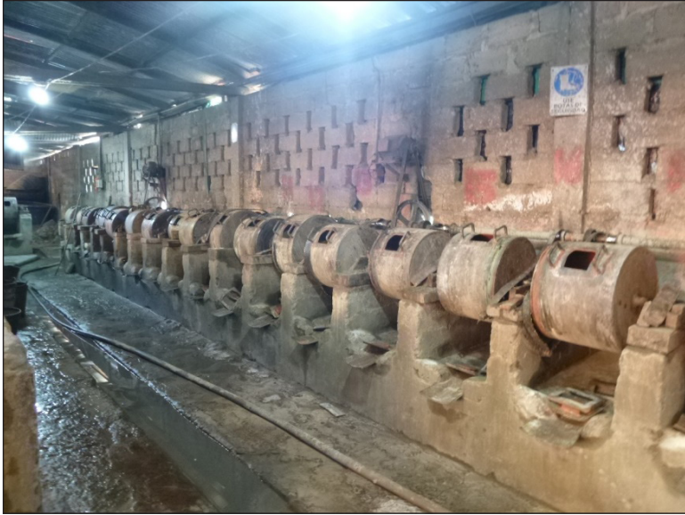
Figure 7. A closer view of the ball mills.