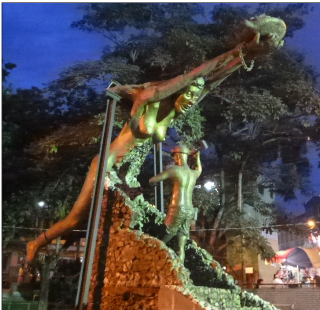
Figure 2: Monument in the central plaza of Segovia.

Our purpose from here is to identify specific entanglements of miners and mercury across several different cases. As stated, mining as an activity is het-