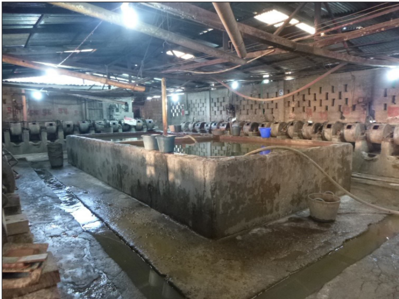
Figure 6. The ball mills in Santiago's workshop.

As payment, the miners would leave all the leftover tailings in the cocos . The mercury process is relatively inefficient in terms of extraction, recovering as little as 30% of the gold (Cordy et al. 2011; Veiga et al. 2014). Santiago would then perform a cyanide extraction on these tailings over four to five days in a series of concrete pools (Figure 9) or pits dug into the older tailings (Figure 10). Santiago did not let me see the process of extracting gold from cyanide. However, other sources describe a zinc and acid based extraction which releases