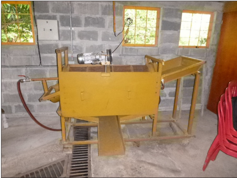
Figure 4. Carlos' Gemini table for finer gravitational.

to consider new business principles, as he found himself responsible for capital equipment, even though he had not purchased the equipment himself. All this represented a fundamental change in the way he approached mining. He rose to what he described as a great challenge and, with assistance, he succeeded in mining gold without mercury.