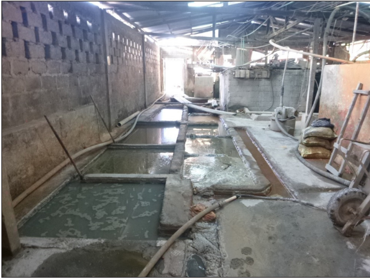
Figure 9: Cyanide extraction in concrete pools. The planks to the rear are used as a walkway over the cyanide.