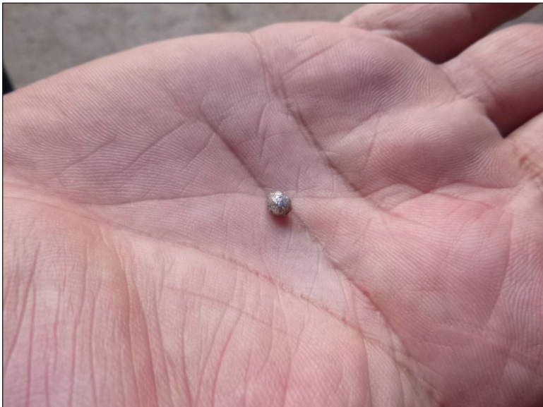
Figure 8: A disappointingly small ball of mercury-gold amalgam.