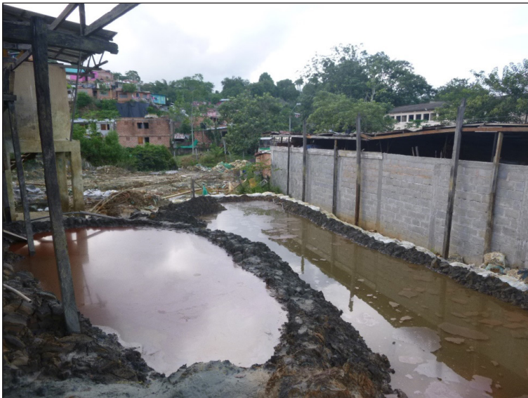
Figure 10: Cyanide pools in the tailings outside. The visible buildings are residential.