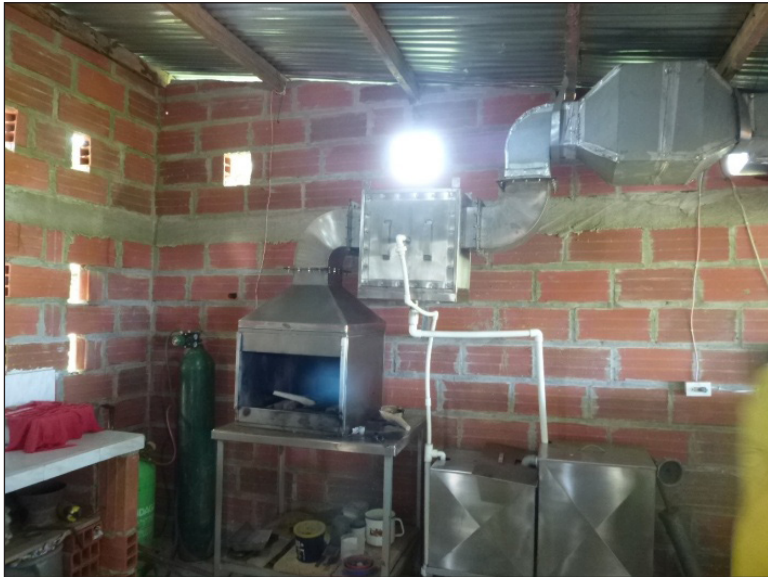
Figure 5. The extraction workshop: mercury-gold amalgam is refined under this fume hood.

along the old river bed in one direction, and backfilling behind them. The mine employs sixty workers, five excavators and three tip trucks (a very different operation to Carlos' two-man dredge). Previously, the mine used massive quantities of mercury. In the earlier operation, the earth dug from the pit was washed along sluices with bags containing mercury at the bottom. Up to nine kilograms of mercury used to be added to these sluices daily, and while it is unclear what portion was lost to the environment, this is still a considerable quantity. This process applied the extraction principle of sluicing sand over mercury. Two men at a time would wash the earth down with high pressure hoses, with two ten-hour shifts a day. In the past few years, however, Esteban had engaged with a regional university who helped design new sluices, allowing him to work without mercury. The university facilitated the acquisition of a large trommel (a larger version of the one shown here in Figure 2). A trommel is a rotating perforated drum for a secondary gravitational extraction of the heavy sand caught in the sluices. Mercury is still used for the final extraction. However, additional safety measures have been added and the operation is carried out in a controlled environment. For example, fume hoods extract mercury vapour and breathing masks and other protective equipment are used (Figure 5).