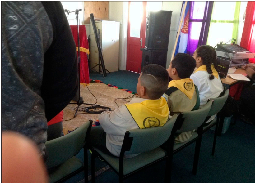
Figure 8. Photograph of Tongan church meeting space in an adapted school classroom in a Brisbane school.

Figure 8 shows the traditional use of a mat in an adapted space used for a church service. This church gathering takes place on a weekend and uses the local school for their services. The classroom space shown in the image has been adapted for church use and the addition of a traditional mat provides a cultural furnishing of the space as well as conveying dignity to the temporal place of worship. During my observations in both Auckland and Brisbane, I came across several church groups using community halls, schools, and business spaces for their weekend services. This is a common practice amongst church groups in Pacific diaspora contexts while they fundraise for their own