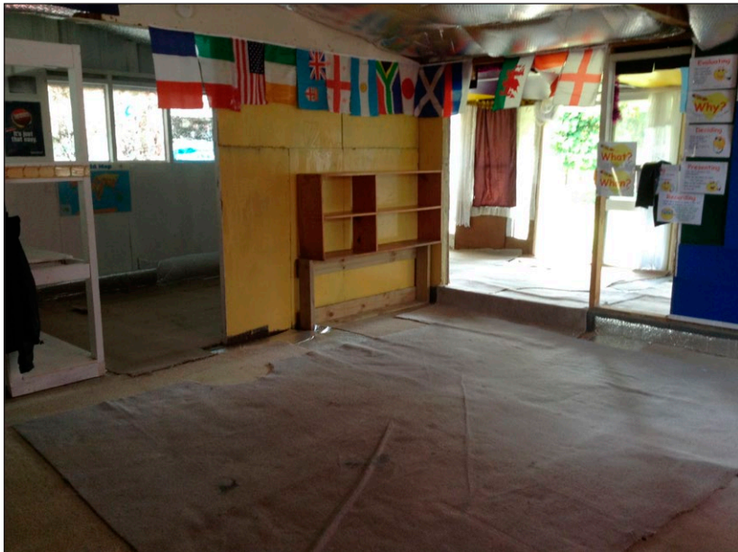
Figure 21. Photograph showing a common practice, of converting garage spaces for shared family living areas, in Auckland. Photographer: Author (7/12/2015).

Figure 21 shows the use of an adapted space in a Tongan/Samoan family home in Auckland. The importance of shared or common areas, amongst Tongan fāмили/kāinga or Samoan āiga (traditional template), is evident in this conversion (adapted space). This garage space had been converted into an extra living area where family gather for special events (such as birthdays, funerals, or prayer meetings). The extra rooms to the side of this shared open space provided further living quarters for this family. During my observations in both Auckland and Brisbane, it was common to see both Samoan and Tongan families using their garage spaces as extended living areas. This common practice of converting garage or carport spaces allows larger families to provide extra room for their members. This practice also allows a family to support extended family members, usually newlyweds or recently migrated families needing a place to stay temporarily while they are saving for their own place to settle. Providing shared living spaces in the home is a traditional template