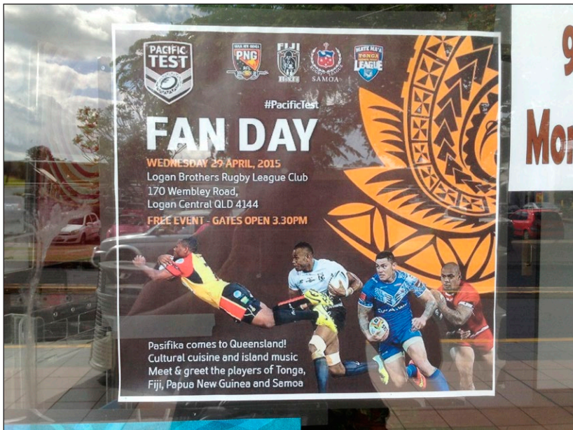
Figure 19. Photograph showing Pacific Island designs used in a community poster, promoting a Pacific Island sport event, in Logan, Brisbane.

Figure 19 shows the use of tatau (tattoo) designs in a community poster that promotes a Pacific Island rugby league event in Brisbane. This demonstrates the pan-Pacific identity via adapted templates, and solidarity through traditional meanings that Pacific diaspora communities share in the Brisbane context. The cultural designs used here are unifying symbols accepted across several groups affiliated with the Pacific region and homelands. Such events like the rugby league and cultural celebration days promote solidarity and shared cultural pride amongst diaspora Pacific Islanders in Brisbane. The adaptation of material culture within diaspora contexts is not a loss of culture, rather an enrichment of cultural values and meanings that are often shared across several Pacific groups.