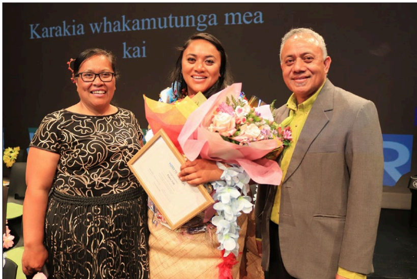
Figure 18. Photograph of Tongan graduate with parents, holding flower arrangement and synthetic flower lei , in Auckland. Photographer: Rose Vainikolo Taumoeanga (24/11/2018). Used with permission.

Figure 18 shows a Tongan graduate with her parents, holding a floral arrangement that had been prepared by the local florist, as well as a lei made from fabric and plastic materials. This is an example of the use of adapted materials and templates with traditional meanings. Such items, although not traditional, continue the traditional act of gifting floral kahoa (necklace or lei ) to a top scholar at an academic event in Tonga. Like the previous image, this photo also shows evidence of modified materials in the making of kahoa , with an assortment of kahoa lolo . Families and friends of the graduate will have prepared these kahoa lolo days before the graduation ceremony and presented the kahoa to her as a way of showing their love and respect for the graduate, and as an acknowledgement of the sacrifices she and her family have made to