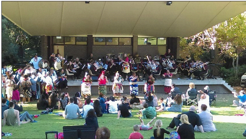
Figure 7. Photograph of Tongan community performance in collaboration with community brass band in Brisbane. Photographer: Dr. Charmaine 'Ilaiū Talei (3/6/2017). Used with permission.

Figure 7 shows the traditional use of kie tonga and cultural adornments in the teunga (traditional Tongan dance costume) worn by dancers at an adapted space, during a collaborative performance by Tongan community members and the local brass band in Brisbane. A Tongan traditional tauolunga is performed by five female dancers, supported by community members, both non-Tongan