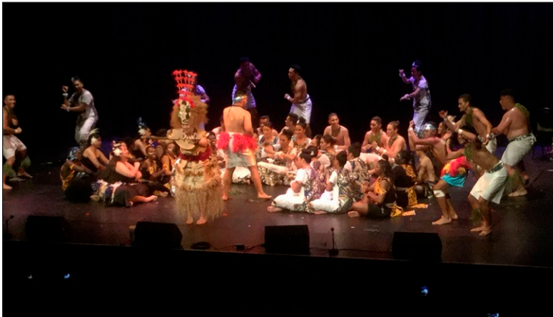
Figure 4. Samoan dancers wear traditional attire in Brisbane.