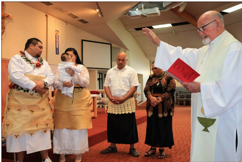
Figure 1. Religious ceremony, baby dedication in Auckland. Photographer: Rose Vainikolo Taumoeanga (19/11/2018). Used with permission.

Figure 2 shows the use of traditional materials in the costumes of Tongan dancers in Auckland. This event is a celebration of Tongan cultural heritage in