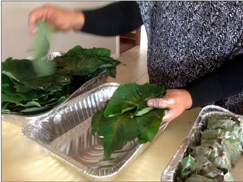
Figure 15. Photograph showing the use of foil trays in preparing a traditional Tongan dish of lū sipi , in a Tongan/Māori family home in Brisbane. Photographer: Author (11/7/2015). Used with permission.

Figure 16 shows the use of adapted materials in the creation of Tongan dance costumes, used by both Tongan and non-Tongan students at a Brisbane school cultural celebration. Non-traditional materials were used to reduce the cost of making traditional costumes and because they were readily available to