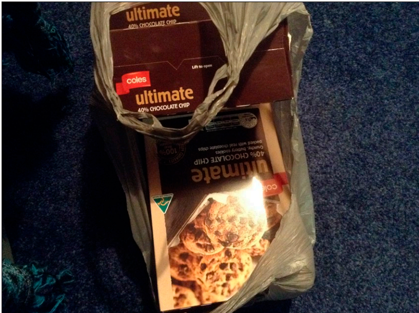
Figure 20. Photograph showing the use of Australian-bought goods, parcelled and gifted by Trans-Tasman migrants from Brisbane to Auckland. Photographer: Author (11/3/2016). Used with permission.

Figure 20 shows the continued act of reciprocity and the traditional meanings of this between Auckland and Brisbane diaspora through the gifting of local specialties using adapted materials. This image shows a favoured type of biscuit for Auckland-based people which is highly prized in New Zealand diaspora because of its distinct flavour. It is a commonly available product in Coles franchise supermarkets in Australia. This biscuit is usually purchased and packed as luggage in Australia, then gifted on arrival to family members in Auckland. This package was delivered to family members who had personally requested the biscuits online via Facebook posts on hearing that a family member would be travelling across the Tasman. This form of material cultural adaptation is based on the reciprocity and cultural gifting that takes place between family members travelling between New Zealand and island homelands, usually with the exchange of more traditional foodstuffs in the 'umu pack 13 or crafts made in Samoa/Tonga.