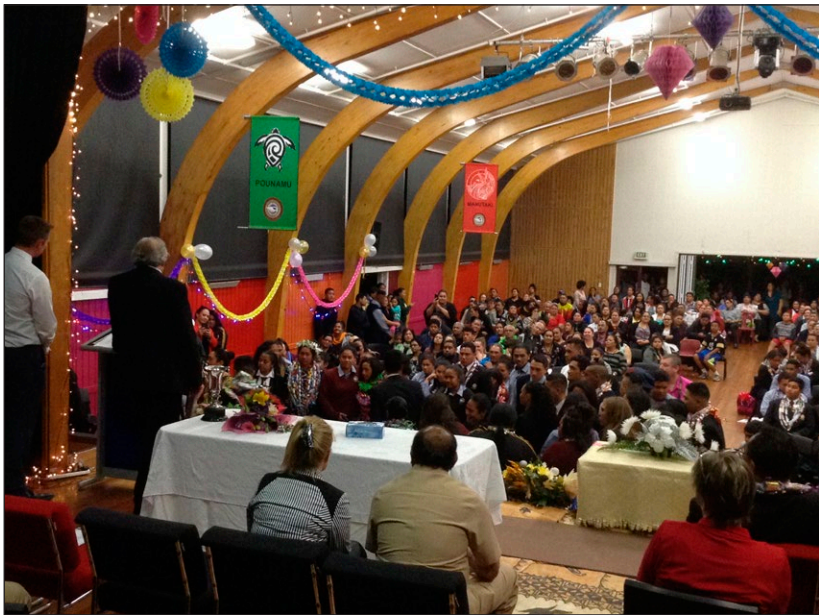
Figure 5. Photograph of prizegiving event using traditional materials as decorative and symbolic elements in an Auckland school hall.

Figure 5 shows the use of traditional ngatu (decorated bark-cloth made from the paper mulberry tree) and fine mats in an adapted space used for an academic ceremony in Auckland. It is traditional in the Pacific Islands to celebrate achievement with the gifting and adornment of traditional fine mats and bark-cloth (Tongans call this bark-cloth ngatu while the same type of textile is known to Samoans as siapo ), as this is a way of edifying both the event and