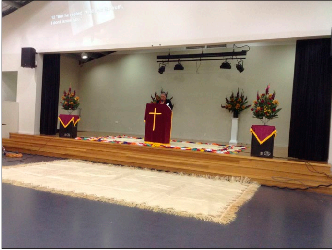
Figure 3. Fine mats used in decorating church space in Brisbane. Photographer: Author (5/7/2015). Used with permission.

ally in the background. This dance item was presented as the final part of this group's performance, signifying completion, as part of a city-wide secondary schools' cultural celebration in Brisbane.