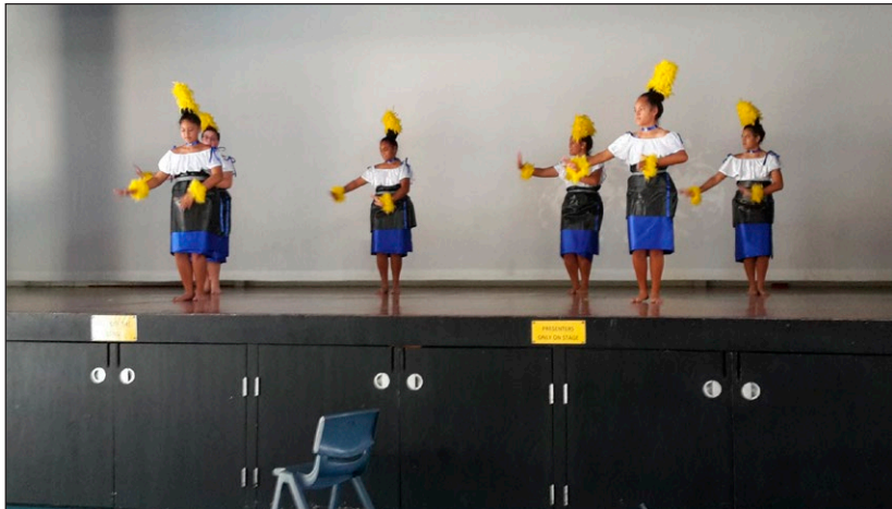
Figure 16. Photograph showing non-Tongan and Tongan students performing a Tongan tauolunga in teunga (dance costume) made extensively from adapted materials in Brisbane.

members of this school cultural group (including Tongans, Samoans, Māori and South African students and their parents) based in Brisbane. The ta'ovala was created by Samoan and Tongan staff and student volunteers from black weed-mat and tied with braided polypropylene rope, replacing the traditional materials of lou'akau and niu that were not available in bulk to these students and their families. Accessories like the tekiteki (feathered head stick), vesa (wristlets and anklets made from stringed feathers), and the kahoa tau'olunga (ribbon-tied necklace used for dance) were also created by Samoan and Tongan student volunteers using less traditional materials purchased from a local Chinese shop. These included satin ribbons, dyed ostrich feathers, and acrylic rhinestones which combined, created a look that mimicked the traditional designs of traditionally crafted teunga from Tonga. The off-shoulder style of the white tops were requested by the students because it was fashionable at the time in Brisbane and was created by one of the student's mother using a pattern drawn by a Samoan-Tongan artist 11 based in Brisbane. The overall design of the teunga used by this school cultural performance has maintained the cultural values attributed to the Tongan tauolunga .