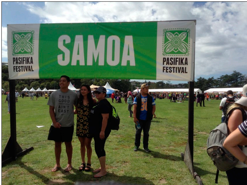
Figure 22. Photograph showing the adapted use of a public sport field, for cultural celebrations in Auckland.

Figure 22 shows the Samoan stage at the Pasifika annual event in Auckland in 2016. This adapted space is usually maintained for a variety of football games, like soccer and touch rugby. However, for the week leading up to the Pasifika event, and during it, there was a hive of activity involving both businesses and community groups in preparing the site. This open area was converted to a performance stage to cater for the expected attendance of Samoan and non-Samoan alike during the cultural celebration. Although the event is a commercialised form of cultural display, there are positive outcomes for those involved in the dances, speeches, crafts stalls and food stalls. Younger generations of Samoans can maintain strong cultural connections through their involvement in this annual event; the visible concentration of Samoans in this space, each year, provides Samoan diaspora with a sense of pride and a reason to maintain their unique cultural knowledge and skills.