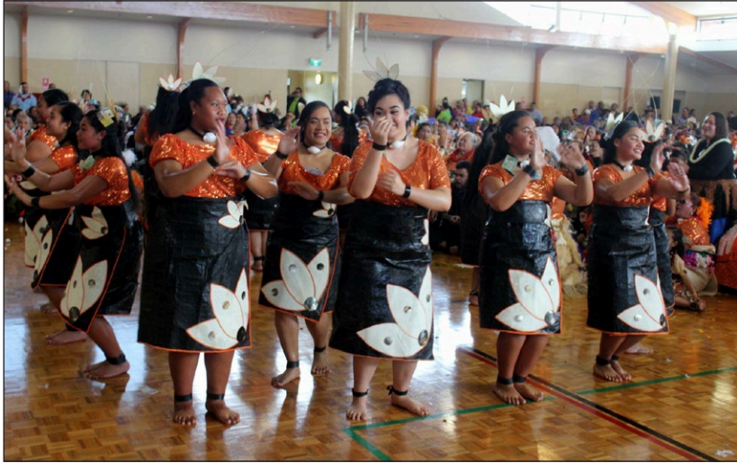
Figure 2. Tongan dance in Auckland community event. Photographer: Junisi Paea (31/8/2018). Used with permission.

a community event that occurred in Auckland. The traditional materials (shells and ornaments) used in the embellishment of the ta'ovala worn by the dancers would have largely been supplied by family members commuting to and from Tonga over previous visits, and particularly by those family members visiting Auckland specifically to attend the event.