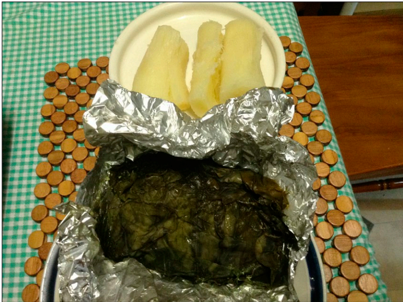
Figure 13. Photograph of lū pulu masima served with manioko in a Tongan home in Auckland. Photographer: Author (11/3/2016). Used with permission.

on a regular basis by this family, as observed in Auckland. This dish is lū pulu masima (taro leaves with salted beef) and contains an ample amount of coconut cream, which in Auckland, will usually be tinned. Traditionally, this dish is made in Tonga with the same ingredients. However, the coconut cream is freshly squeezed, the dish is wrapped in banana leaves, not foil, and then cooked in an ‘umu or earth oven. Tongans based in Tonga are slowly increasing their use of foil, although the use of banana leaves is seen as more economically sustainable and better for one’s health. However, in Auckland, it is now common practice to make traditional meals using more convenient methods of cooking like foil-wrapped lū in the conventional oven. Whilst the traditions of using an ‘umu are still practiced by Auckland and Brisbane diaspora, these are reserved for significant events like weddings, birthdays, or funerals. In both diaspora and Pacific homeland contexts, the use of foil and conventional ovens are considered signs of fakalalakaka , a Tongan concept referring to modernity and progressive changes that improve overall areas of living (‘Ilaiū 1997, 82; ‘Ilaiū-Talei 2014, 37).