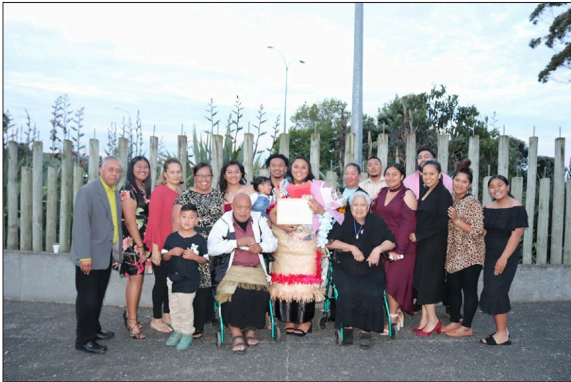
Figure 6. Photograph of Tongan academic graduating from a tertiary institute based in Auckland. Photographer: Rose Vainikolo Taumoeanga (24/11/2018).

Figure 6 shows the use of traditional ta'ovala at a university graduation in Auckland. The Tongan graduate and her grandfather are wearing ta'ovala to mark the special occasion of her attainment of a tertiary qualification. The use of traditional attire during academic celebrations in tertiary spaces is a common practice amongst Pacific Island graduates and their families, including Samoan and Tongan academics. This act of respect is in acknowledgement of both their families' support and their Pacific indigeneity, thereby connecting to their island homelands within their diaspora contexts. Also, the adornment of bodies with these valuable materials elevates the event, in other words, adapts the non-traditional space into a culturally meaningful space even, if just temporarily.