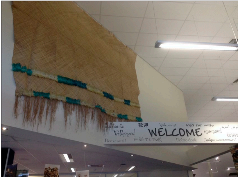
Figure 11. Photograph of Samoan ‘ie toga displayed above entry to a public, council owned, library in Logan, Brisbane. Photographer: Author (14/4/2015).

Figure 12 shows the use of Tongan fine mats known as kie ha’amo a and ngatu in a baby shower event that was celebrated by both Samoan and Tongan family members of the mother-to-be. A significant observation made at this event was the intermingling of Samoan, Tongan, and Western ideas in the re-thinking