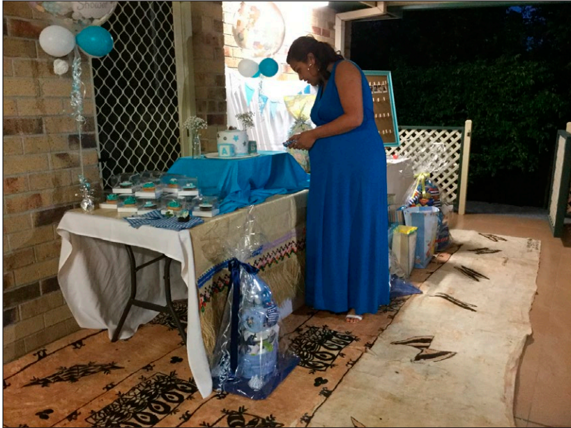
Figure 12. Photograph of a display using ngatu and kie tonga at a baby shower in Brisbane.

around what a baby shower ought to be. It was discussed by the older women attending the event that it was unusual practice for them personally, to celebrate a baby's imminent arrival. They compared this new celebration to their traditions of visiting a mother and her new-born to welcome a baby after its birth. This unique use of traditional material culture, in a reinvented event using a converted backyard space, demonstrates how culture is evolving with Pacific Islanders living in diaspora contexts.