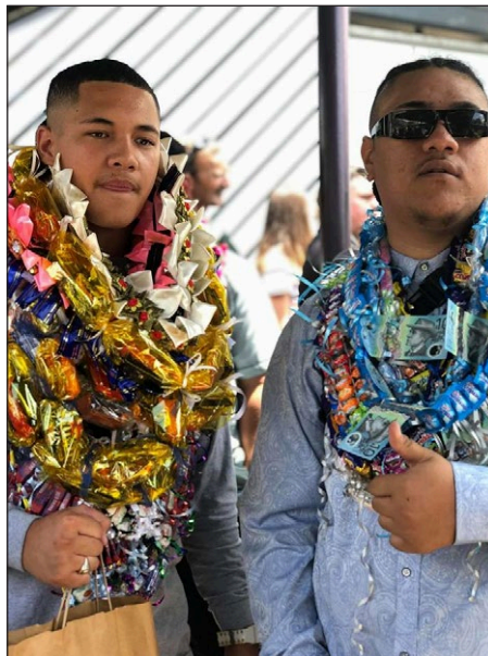
Figure 17. Photograph of two Pacific Islander high school graduates in Brisbane. Photographer: Robyn Finau (17/11/2018). Used with permission.

Figure 17 shows the use of adapted materials: shop-bought confectioneries and Australian-dollar bills were used to create the kahoa lole (lolly necklace) and kahoa pa'anga (money necklace) worn by two high school graduates in Brisbane. These items were gifted by family members and friends to the students who were celebrating the end of their formal education at year twelve. In Auckland, I had observed on the rare occasion the use of fragrant flowers and foliage (when available) for high school graduations, but the kahoa lole was more commonly used. Most rare was the kahoa pa'anga with New Zealand dollar bills. Samoan informants refer to kahoa lole as 'ula lole (lolly necklace). 'Ula lole or kahoa lole are commonly worn during special occasions like graduations, birthdays, Mothers' Day, Fathers' Day, or Children's Day (White Sunday) celebrations. The 'ula lole or kahoa lole is placed on the person who is celebrating their milestone or achievement by relatives or friends. It is important to note that the practice of endowing a person during celebrations with 'ula lole or kahoa lole , or even kahoa pa'anga is becoming more acceptable across other Pacific Islands groups 12