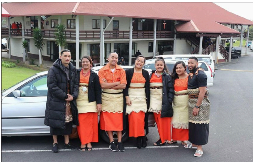
Figure 10. Photograph of Tongan community members representing their village in Auckland-based event. Photographer: Iunisi Paea (2/9/2018). Used with permission.