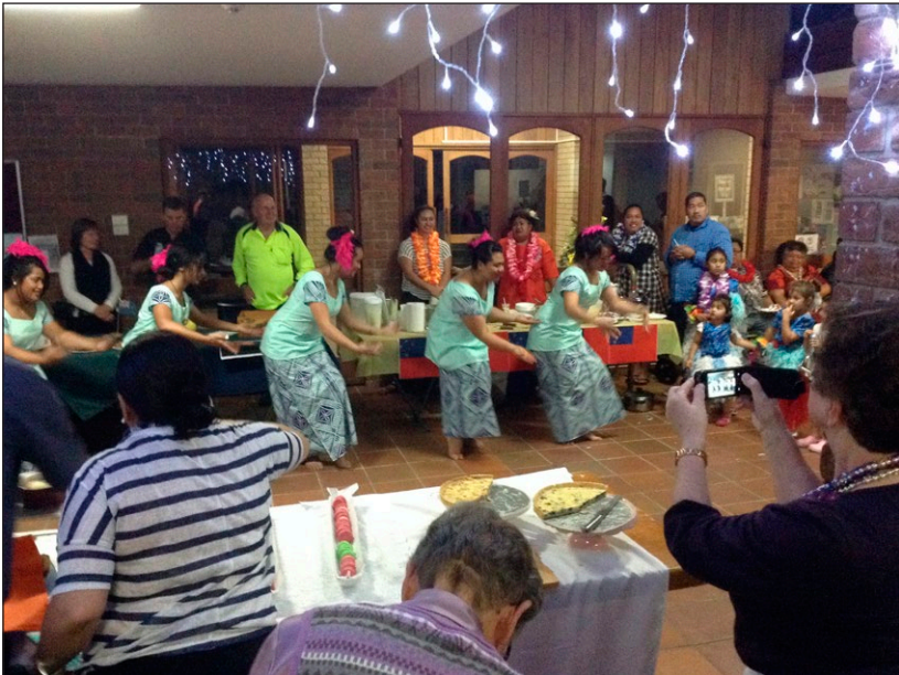
Figure 24. Photograph showing the adapted use of a covered foyer area, and entry to a church building in Brisbane, for the purpose of a cultural celebratory event organised by church members.

Figure 24 shows the use of an adapted space, a foyer area outside a church building in Brisbane, which is being used for a cultural performance and the distribution of cultural foods. This traditional siva is performed by Samoan women wearing two-piece outfits known as pule-tasi . The design of pule-tasi is traditional but has been adapted using materials available in Brisbane. The family members supporting their dance, including the younger children, are wearing yellow lei ; these lei are made from fabric and polypropylene materials, available from the local discount store. Although some diaspora spaces and materials are non-traditional, the templates that they are based on remain true to fa'a-Sāmoa protocols of dance and collective family identity.