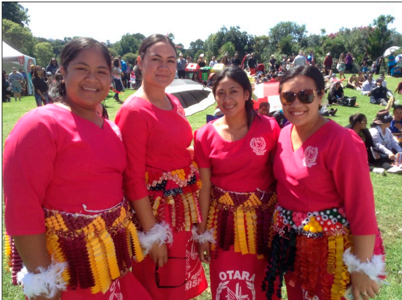
Figure 14. Photograph of Tongan performers at a city council-sponsored event in Auckland celebrating the cultures of the Pacific nations represented in their city's population. Photographer: Author (12/3/2016). Used with permission.

Figure 14 shows the use of locally purchased materials in the creation of teunga for Tongan dancers in Auckland. This is evidence of the use of adapted materials to maintain the practice of cultural arts from Samoa and Tonga. The kiekie worn by the women in this image have been created using polypropylene curling ribbons purchased from a local discount store. The plastic material is easy to work, available in assorted colours, and allows the creation of traditional looking teunga in less time (no traditional planting, harvesting of materials, and preparation required). The popularity of this type of kiekie worn in diaspora contexts relates to the convenience of accessing materials locally and the low cost of purchasing these materials. However, the use of different materials in the creation of kiekie does not remove the significance of wearing one while performing. Women wear kiekie as a sign of cultural respect. The use of kiekie allows further participation of Tongan youth in the celebration of their culture in community events like this, Pasifika 2016, which is an annual event hosted by the Auckland City Council.