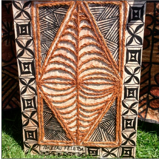
Figure 9. Photograph of a pop-up stall selling kapesi design framed as artwork in Auckland cultural event. Photographer: Author (12/3/2016). Used with permission.